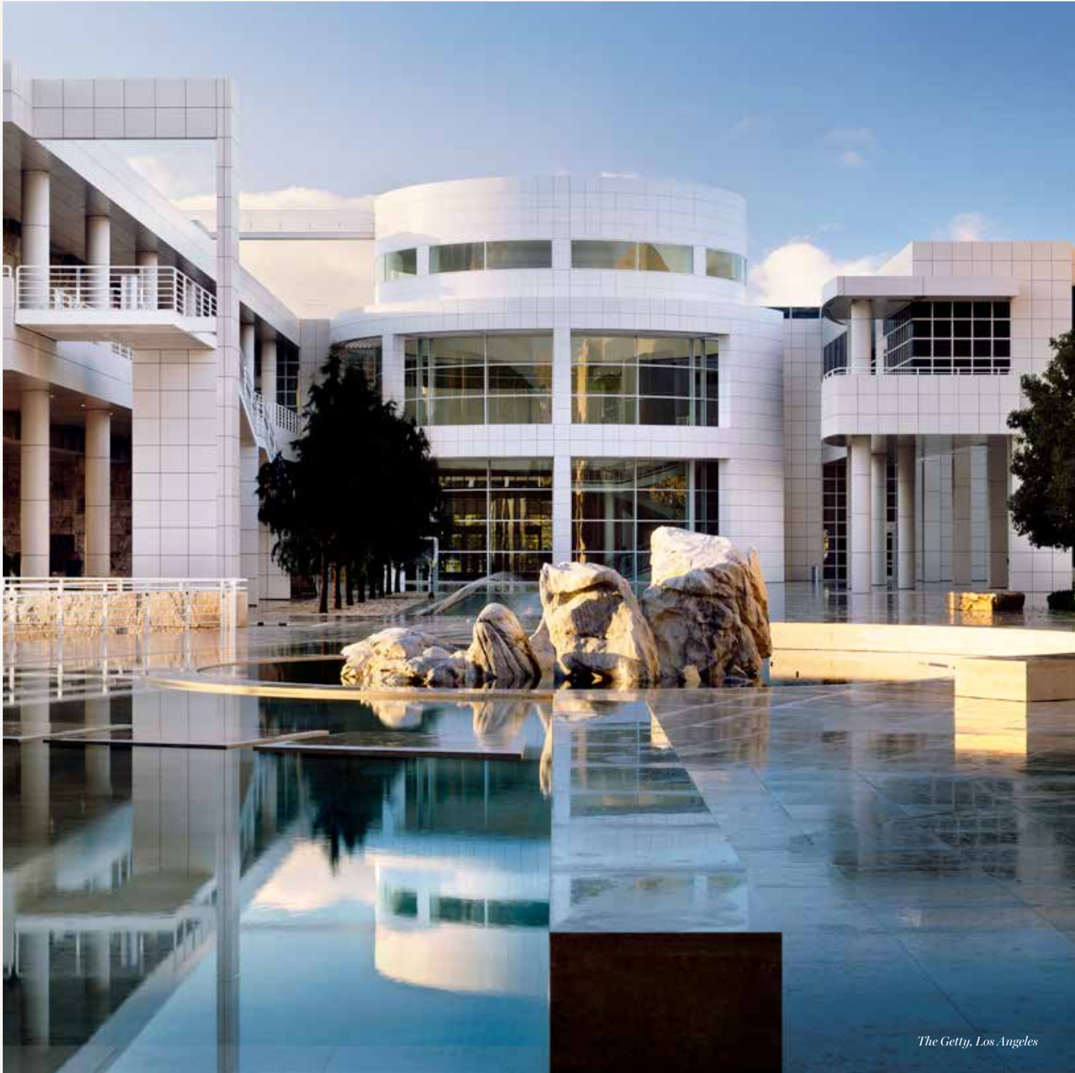
The Getty, Los Angeles