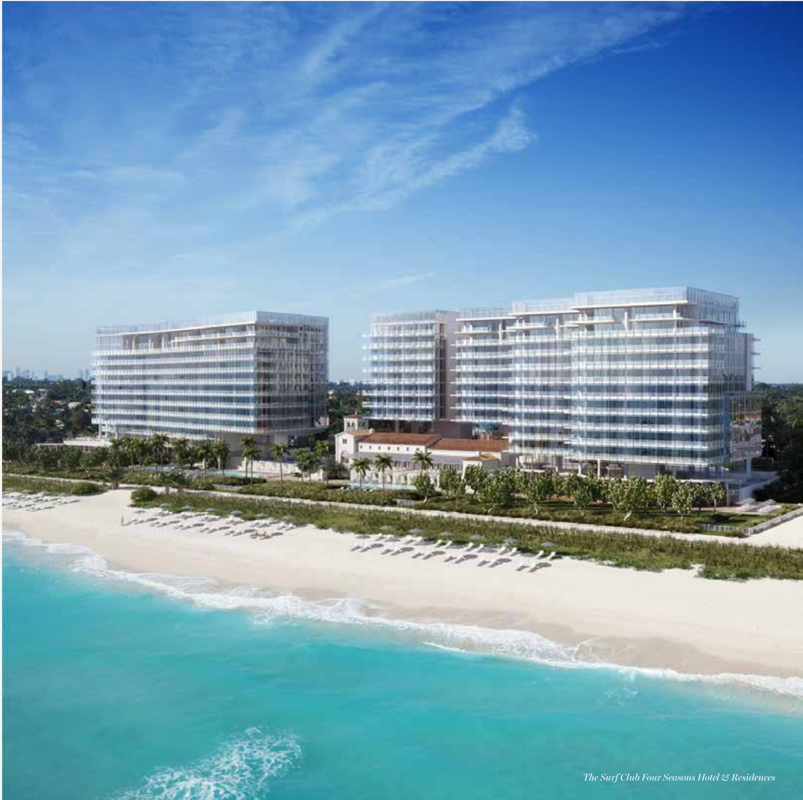
The Surf Club Four Seasons Hotel & Residences