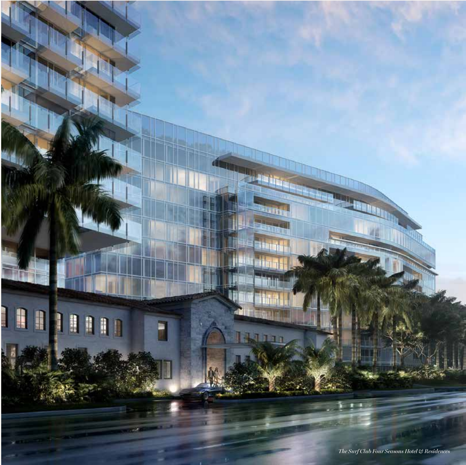
The Surf Club Four Seasons Hotel & Residences