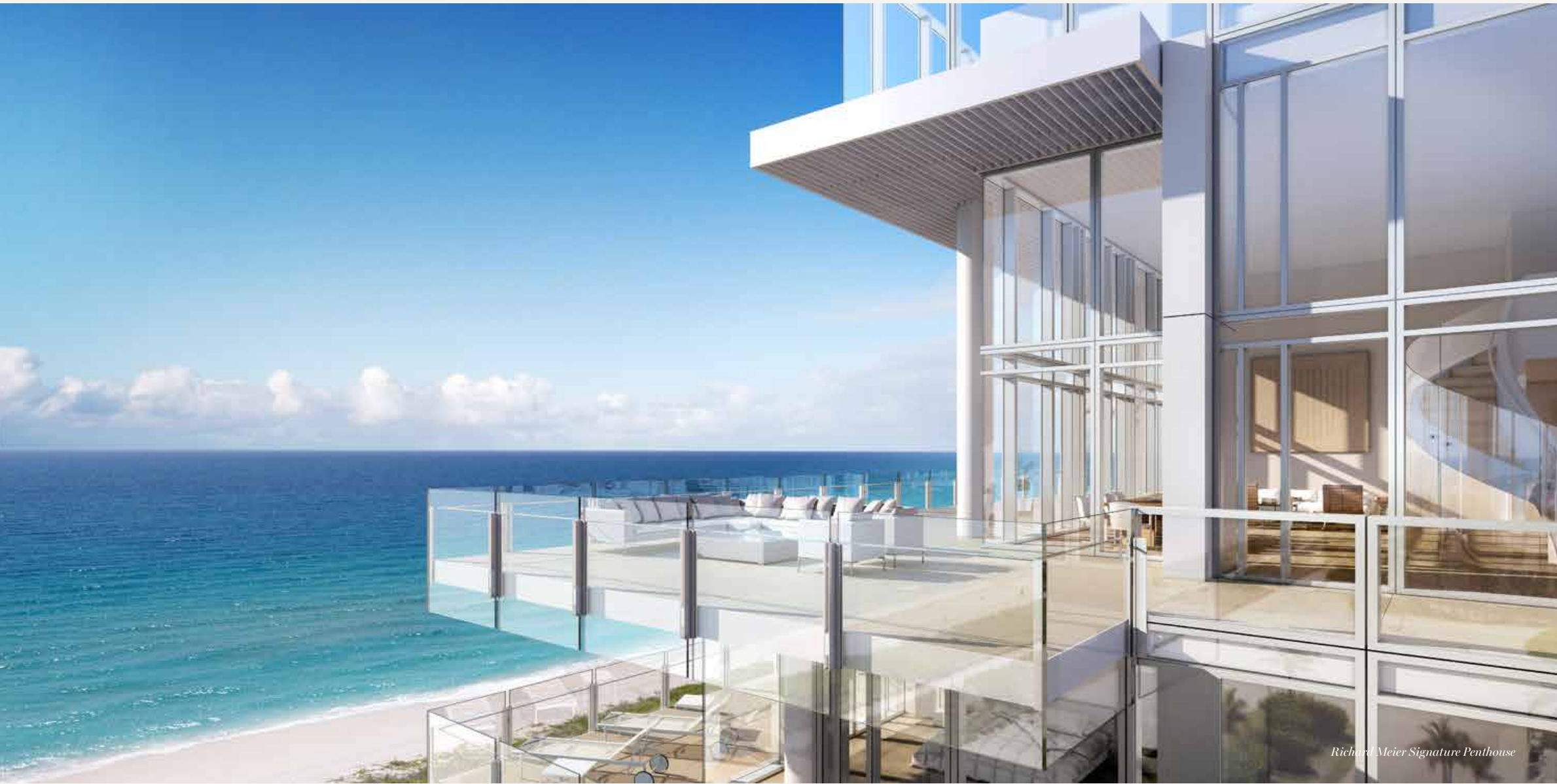
Richard Meier Signature Penthouse