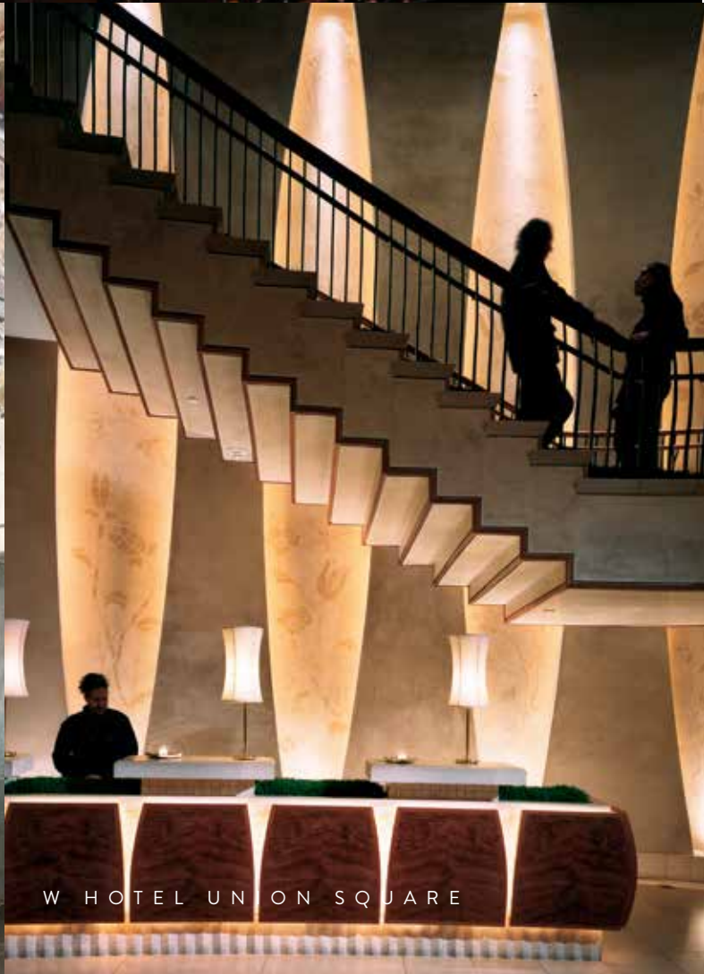
W HOTEL UNION SQUARE