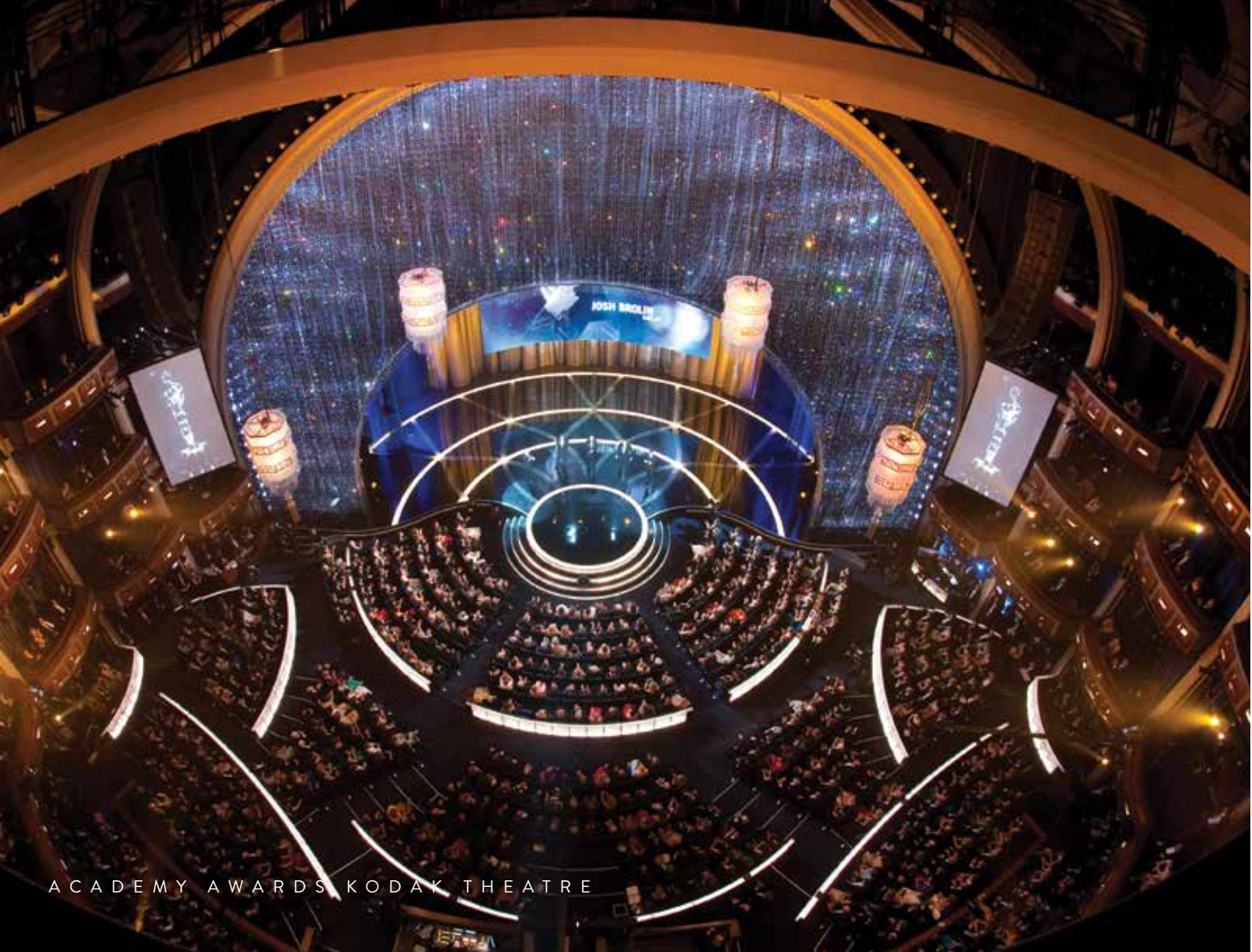
ACADEMY AWARDS KODAK THEATRE